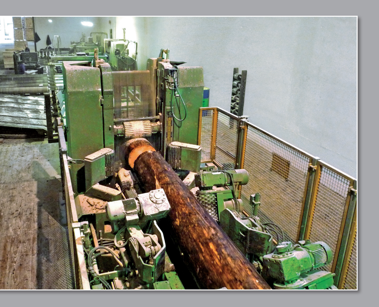
Fast and powerful sash gang saw for highest requirements